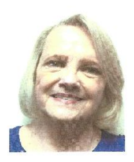
For International Director