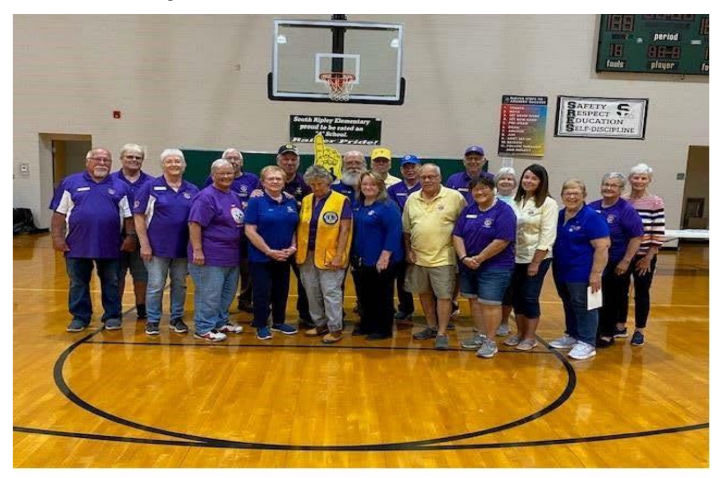
Vision Screening in Ripley County—Our group consists of Lions members from Milan, Osgood, Versailles and Bright and we also have several volunteers from the Ripley County Retired Teachers Assoc. A very active group who also screens students in Dearborn, Ohio, Jefferson, & sometimes Decatur County.