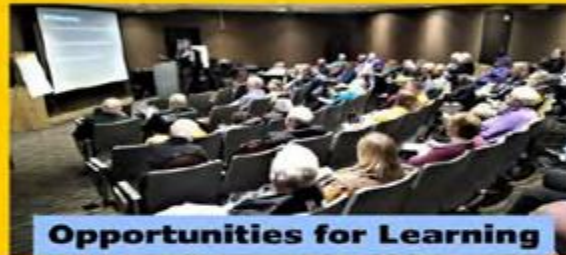
Opportunities for Learning

It's not too early to start planning for 2026.