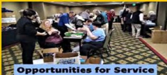
Opportunities for Service

Mark your calendar now for the 2026 Mid-Winter Conference.