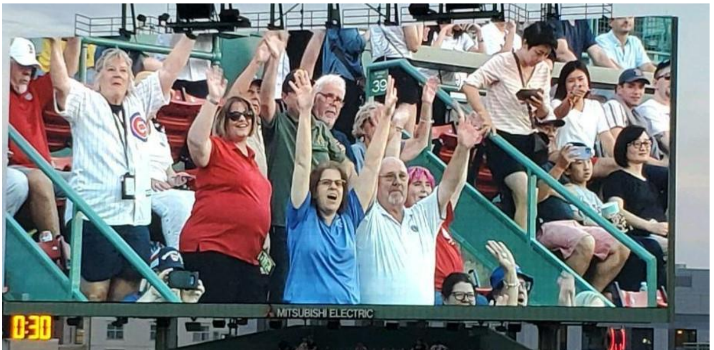
Indiana Lions on the Big Screen at Fenway Park.