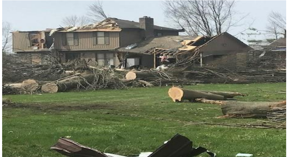
Aftermath from the tornado