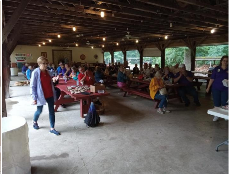
Lions of 25F enjoy food, fellowship, & fun .