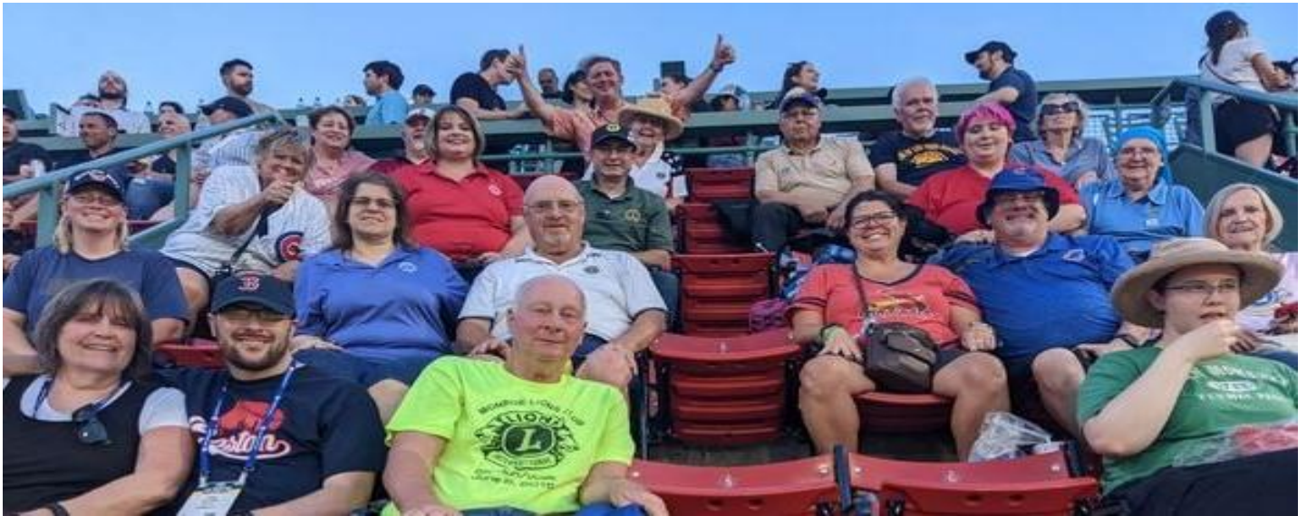
Indiana Lions take in a Red Sox game at Fenway Park during International Convention in Boston