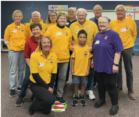
1st Grade Vision Screening at Pipe Creek Elementary