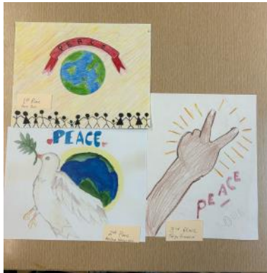
Winning Peace Poster Entries