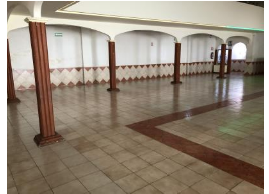
Right: This is about one third of the 60'x60' room that will be used for the mission.