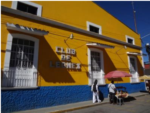
Left: Tezuitlan Lions Club building where the mission will be held.

Currently the district's eyeglass mission is finalizing the team that will travel and provide support for the nearly 3,000 individuals that will be served that week.