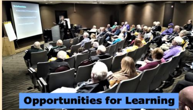
Opportunities for Learning

It's not too early to start planning for 2024. Mark your calendar now for the 2024 Mid-Winter Conference.