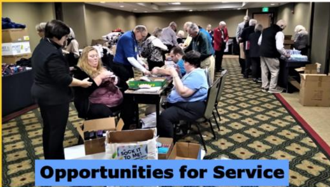
Opportunities for Service

It's not too early to start planning for 2024. Mark your calendar now for the 2024 Mid-Winter Conference.