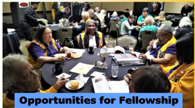
Opportunities for Fellowship

Crowne Plaza Indianapolis Airport January 19-20, 2024