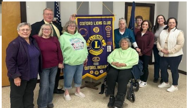
Below: Oxford Lions Club members