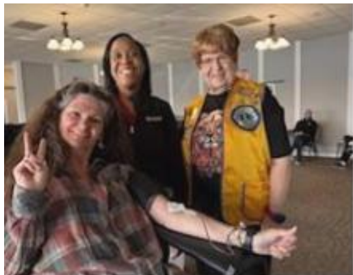
LOFS Lions held a blood drive with the Red Cross in April