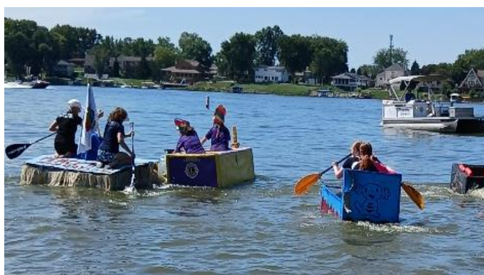
Top Right: The LOFS Lions Boat Team readies the WP Woods to go into the water.