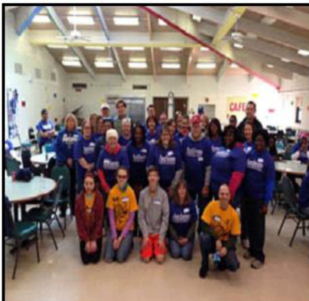
Fall Clean-up Day at the Indiana School for the Blind and Visually Impaired