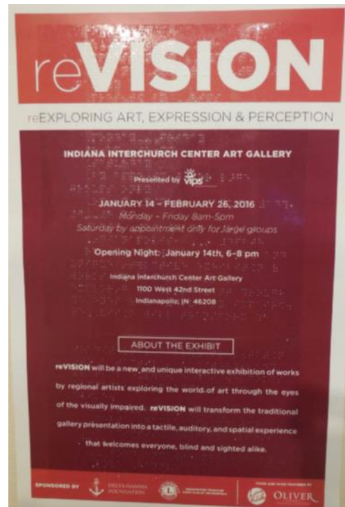
The WTLC helped sponsor reVISION by Visually Impaired Preschool Services. This art exhibit showcased various sight impaired area artists. Several students from ISBVI had entries in the exhibit.