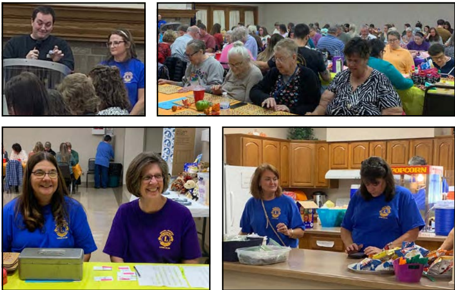
The Brazil Lions recently brought the community together for a fundraiser.