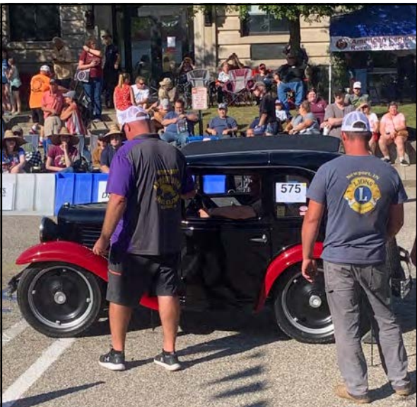
The annual Newport Hill Clumb was a huge success as always, thanks in part to the work of the local Lions Club.