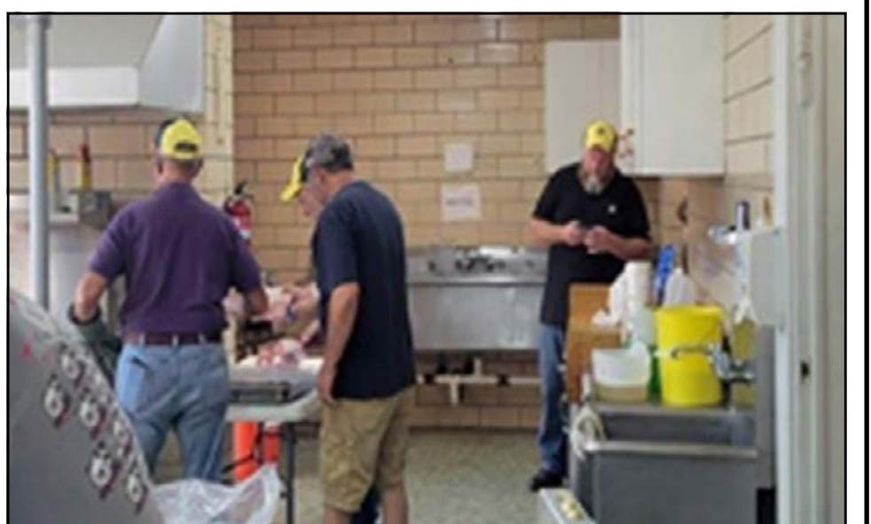
The Star City Lions Club held their annual Pancake & Sausage Breakfast on Sunday, Oct. 1. It’s the best in the county! (The secret is in the sausage.)