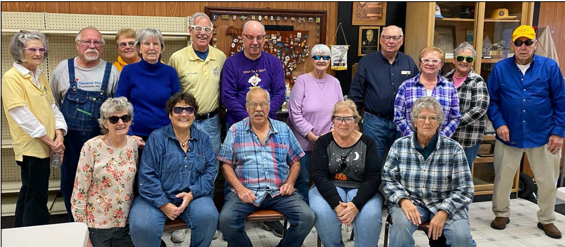
The Milan and Versailles Lions Clubs worked on recycled glasses and decided to try a few on!