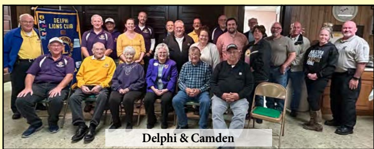
Delphi & Camden