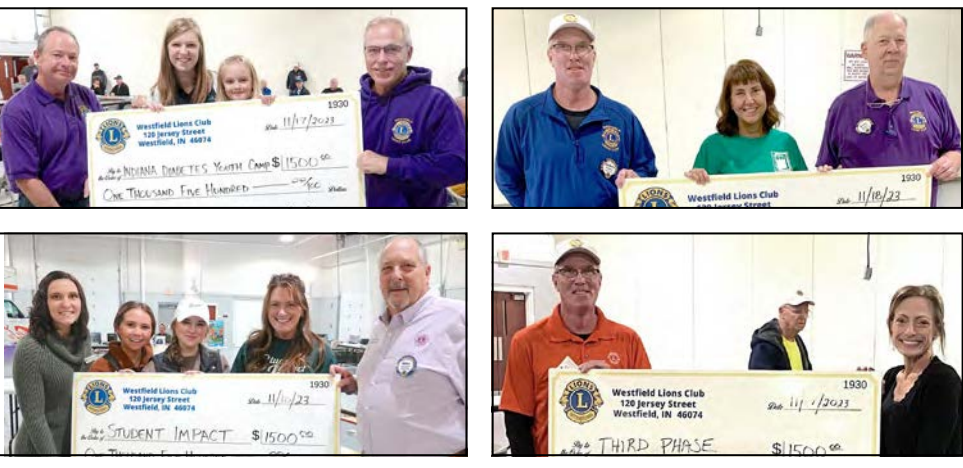
Four worthy nonprofits each received a $1,500 donation from the Westfield Lions Club: Indiana Diabetes Youth Camp (top left), Open Doors (top right), Third Phase Homeless Shelter (above left), and Student Impact (above right).

each of three-qualification rounds and the beginning of the championship round. This year Open Doors, Student Impact, Third Phase Homeless Shelter, and the Indiana Diabetes Youth Camp all received $1,500 donations. For more information or to register for the Westfield Lions Club's future Poker for Sight tournaments, check out LionsPoker.org .