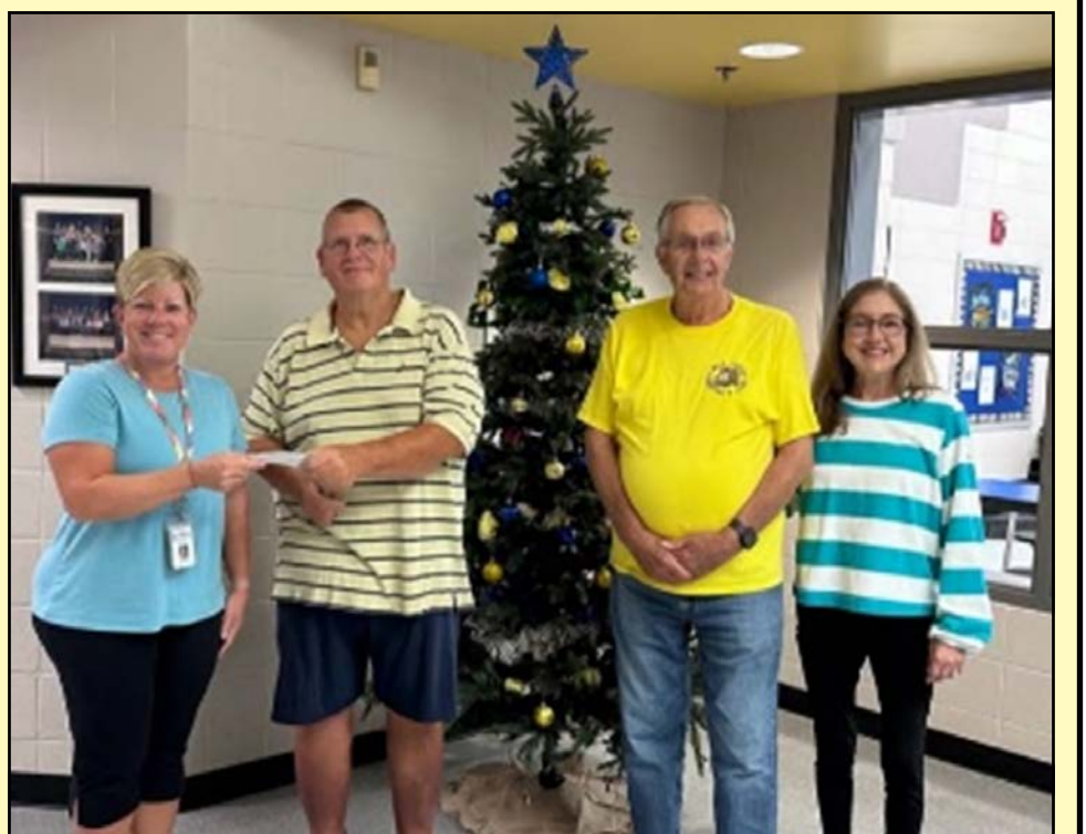
The Mill Creek Lions Club recently made two important donations to Indian Trail Elementary School. (Above left) All third graders received their own dictionary. This is a recurring donation that the Club makes each school year. (Above right) The Club made a monetary donation to all teachers at Indian Trail Elementary. This is the second year the Club has donated $100 to each teacher for their classroom wish lists.