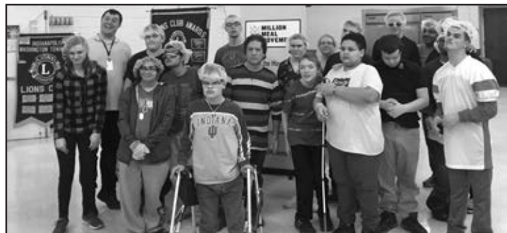
LEOS, STUDENTS AND STAFF — Shown are all of the Leos, ISBVI students and staff who helped on the Million Meals Project.