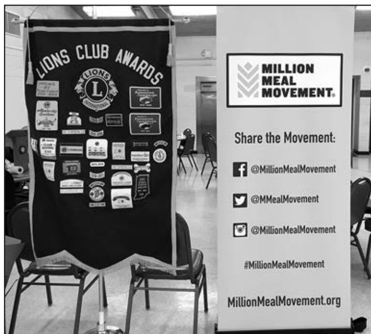
BANNERS TELL THE STORY