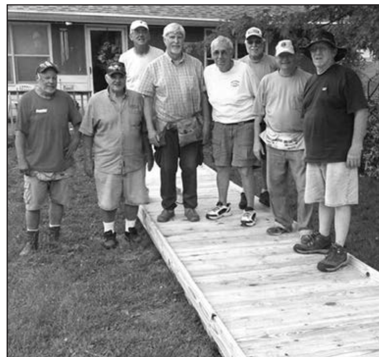
BUILDING CREW — The Bedford Lions Club ramp building crew with the help of two members of the Fayetteville Lions Club built 19 ramps including one in Medora and one in Mitchell this past year varying in length from six feet to 57 feet. They volunteered a total of 679 hours working building these ramps during the months from March to October. The Bedford Lions have built a total of 230 ramps since they started this great project in 1989.