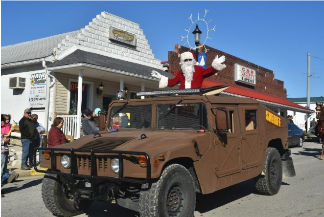
Above Photo: Santa arriving in the Shoals local Christmas Parade. The Humvee was provided by the Martin County Sheriff's Department. Parade held on Saturday, December 5.