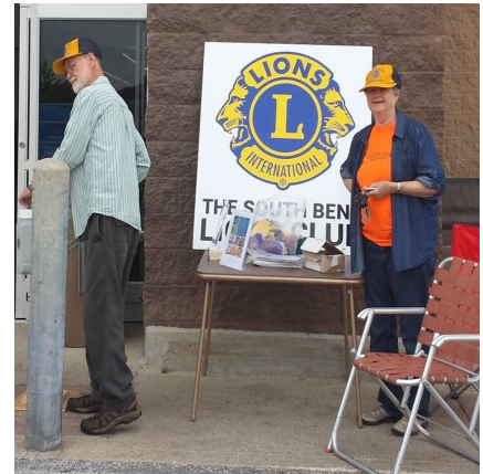
South Bend Lions hosting a White Cane Day.

The next time you are free, join their meeting and congratulate them on 96 Years of Lionism.