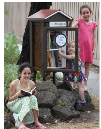
Little Free Library helps all ages