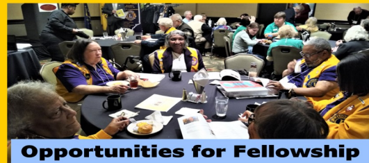
Opportunities for Fellowship

Crowne Plaza Indianapolis Airport January 16-17, 2026