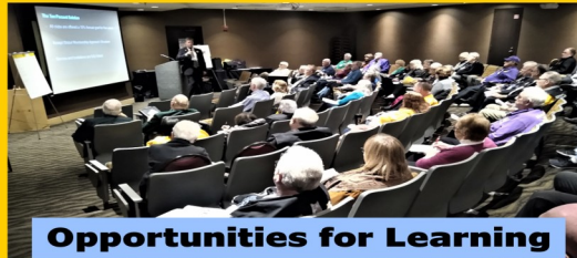
Opportunities for Learning

It's not too early to start planning for 2026.