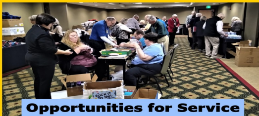
Opportunities for Service

Mark your calendar now for the 2026 Mid-Winter Conference.