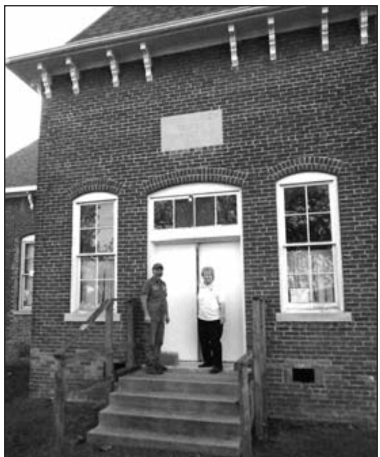
BEING RESTORED — Two members of the New Goshen West Vigo Lions Club are standing in front of the last standing two-room brick school house in Indiana. This school house, located next door to the Lions Den in New Goshen, is being restored by the New Goshen West Vigo Lions Club for use by the community.