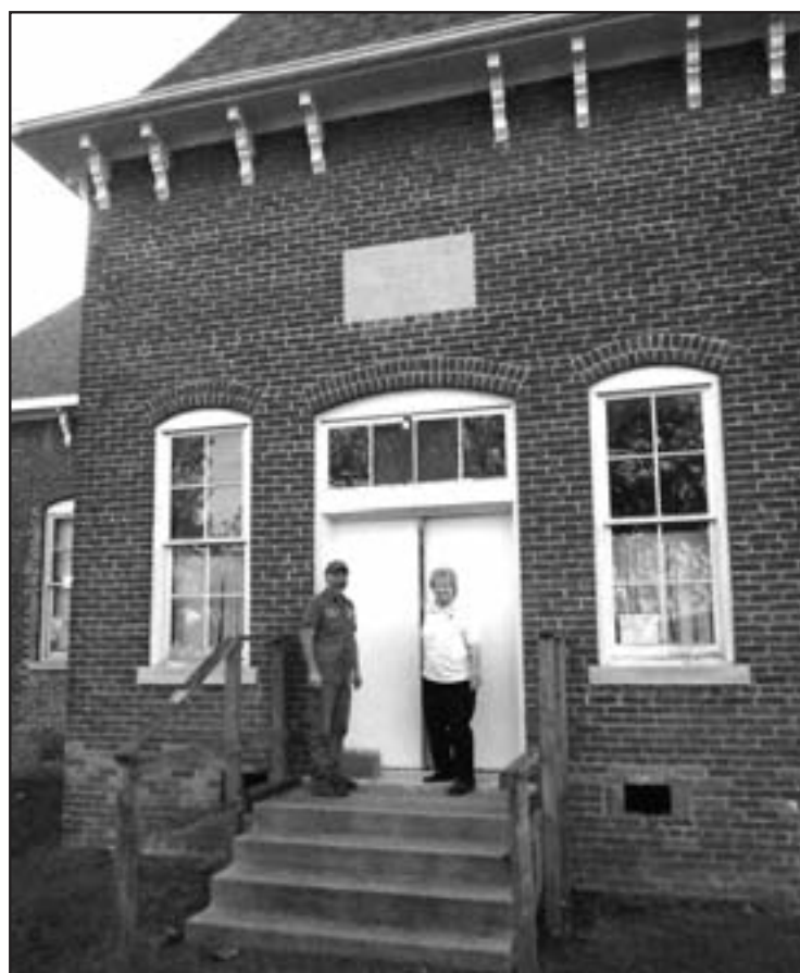
BEING RESTORED — Two members of the New Goshen West Vigo Lions Club are standing in front of the last standing two-room brick school house in Indiana. This school house, located next door to the Lions Den in New Goshen, is being restored by the New Goshen West Vigo Lions Club for use by the community.