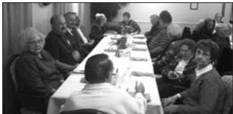
PIERCETON CELEBRATES 85TH — The Pierceton Lions Club held a private party Nov 11 at Millers Merry Manor in Warsaw to celebrate the Club's 85th anniversary. Shown is one of the tables of Lions who joined in the celebration.