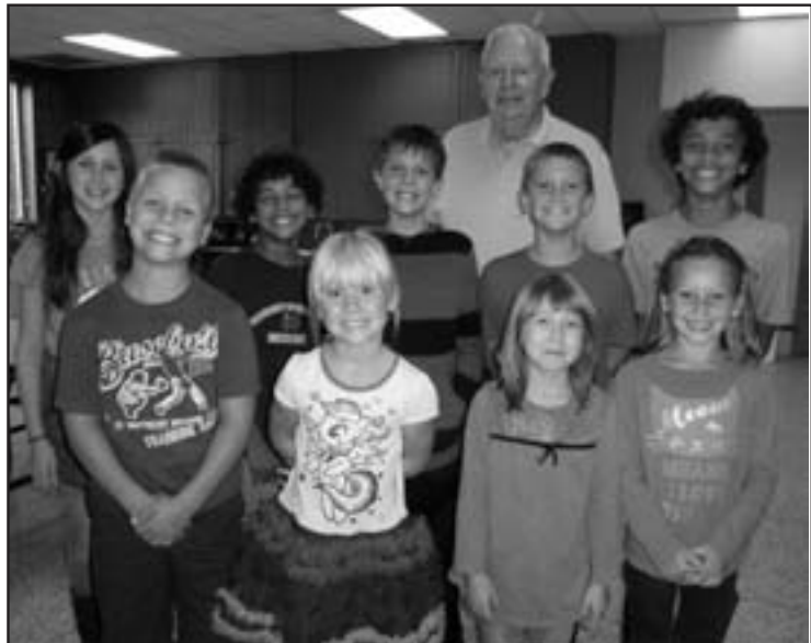
DONATION — The Wakarusa Lions Club has made a donation to the local Boys & Girls Club to provide after school snacks at Wakarusa Elementary School. This program was started during the month of October.