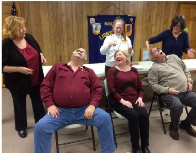
Fun and games at the Markleville-Lapel-Pendleton joint meeting where Lions are trying to roll a cookie down their face and eat it without dropping it.