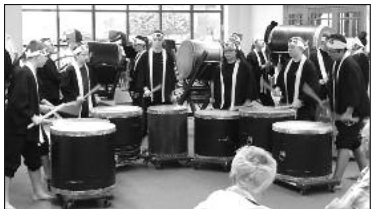
ENTERTAINMENT — Union City Lions Club held its Spring Ladies Night on May 9 and was entertained by the Taiko Drums from Mississinawa Schools. The Japanese Drum music tells a story with rhythm, different size drums and volume. The students also study Japanese history and culture.