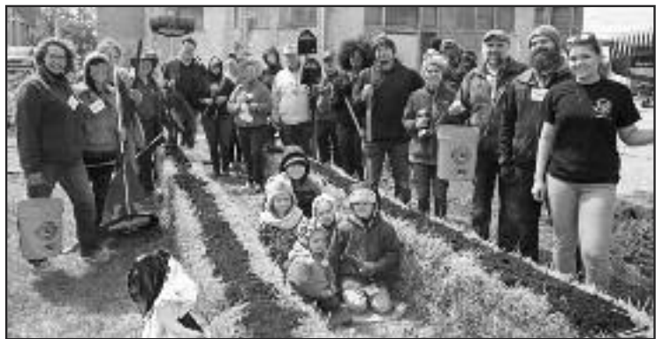
MICHIANA LIONS AND THE GARDEN