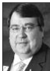
GOV. ROSS DRAPALIK