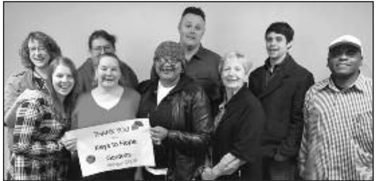
THE PLANNING COMMITTEE