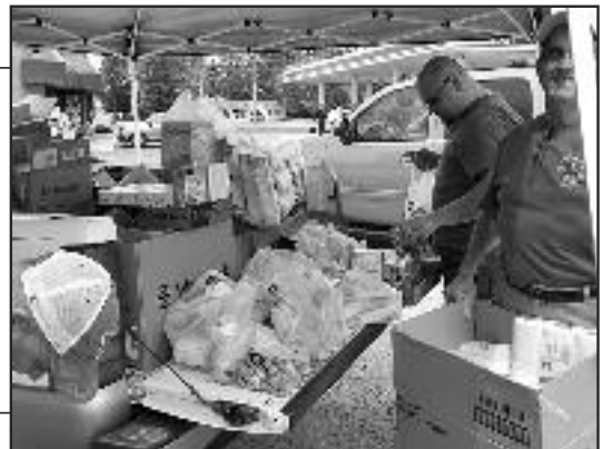
TRUCK FULL OF SUPPLIES FOR MIDDLEBURY FOOD BANK