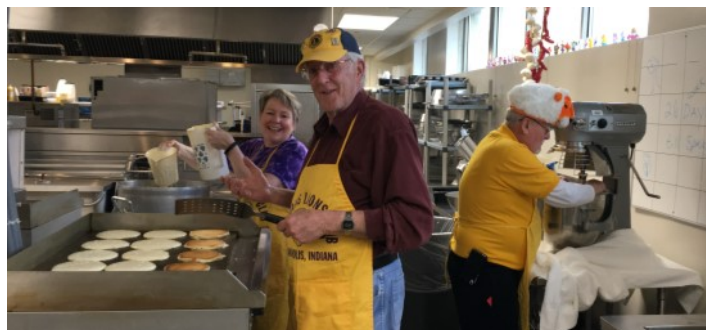
Members of the Ben Davis Lions Club take pride in preparing their award-winning pancakes.