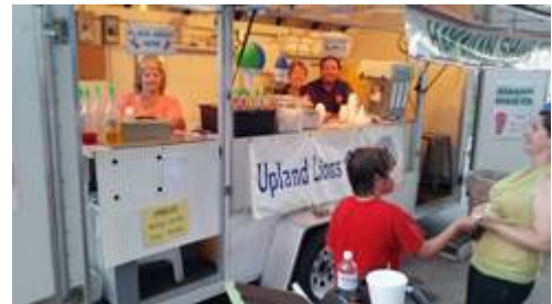
Upland Lions served Shaved Ice