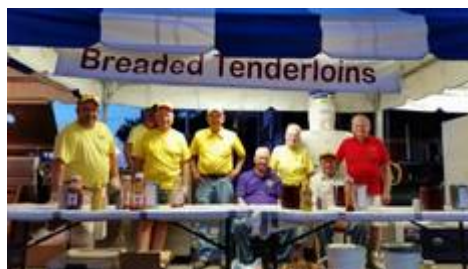
Van Buren Lions served Tenderloins