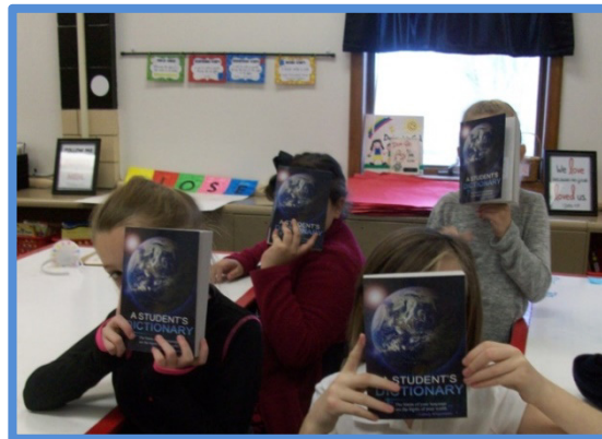
Marion Saint Paul Catholic Parish students love dictionaries so much it becomes a part of them.