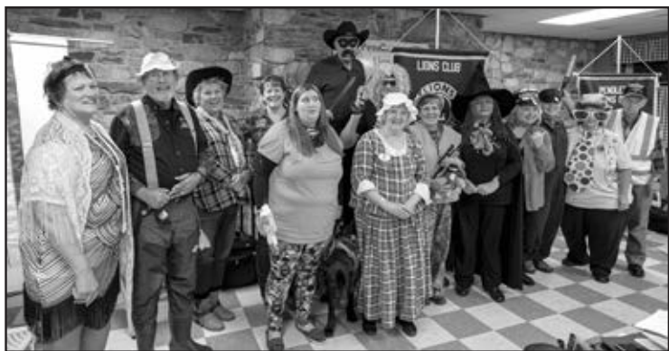
HALLOWEEN THEME — The District D second Cabinet meeting was held on Oct. 29 at Pendleton Lions Club. The Halloween theme was well received and all had a “frighteningly” good time.

Finally, wear your Lion pin and other Lion apparel. Show your PRIDE in being a Lion. I hope to see you around the bend wearing your Lion shirt or pin.