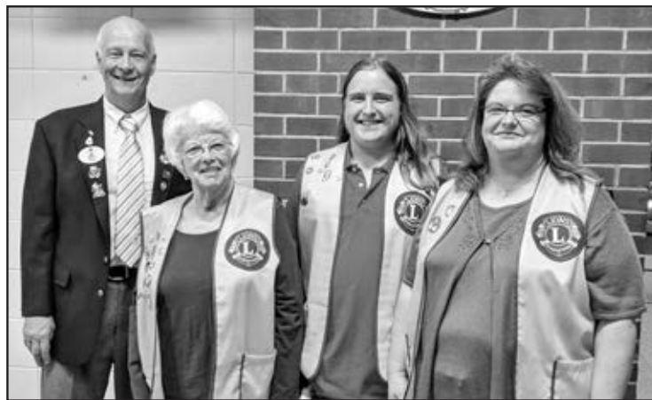
THREE GENERATIONS — Cromwell-Kimmell Lions Club celebrates three generations.