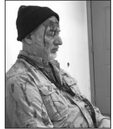
A VICTIM — Looks like the victim might be hurting? Is he really unconscious?