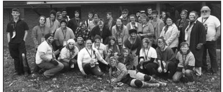
LIONS AT MUTC — This picture show the Lions and students from Jac-Cen-Del High School prepared to be the victims at the MUTC facility. They were at the MUTC training center where Kentucky National Guardsman for Emergency Disaster Response. This training was for nuclear disaster care for victims who survived.