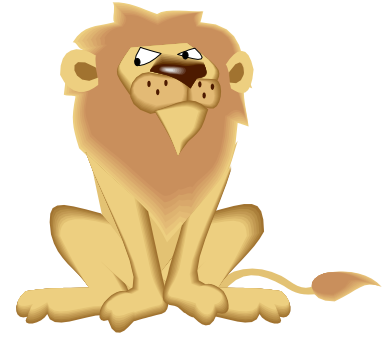
Leonard the Lion says: