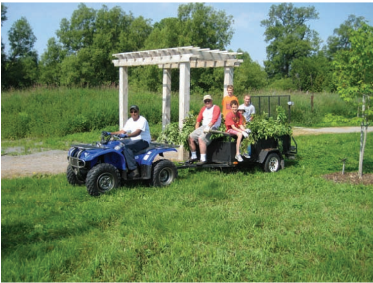
Below, Lions spent the Saturday cleaning up at the Memorial Forest. Great Job, Lions!