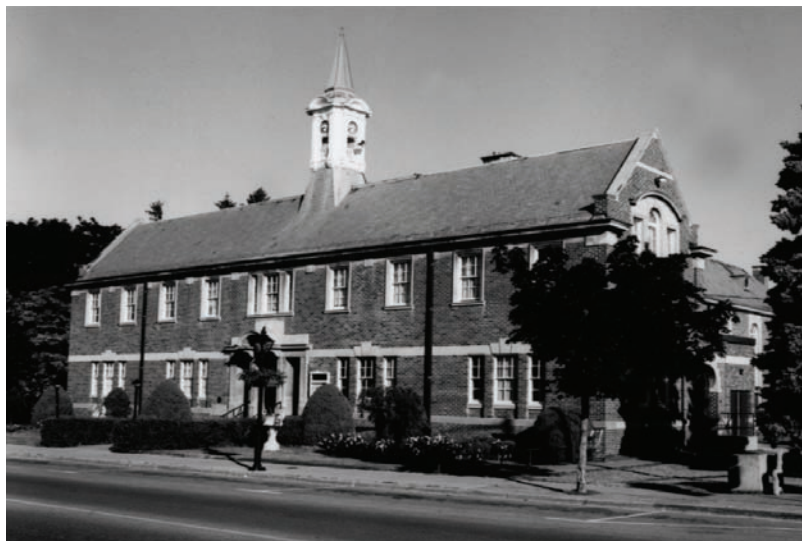
Newcastle Community Hall