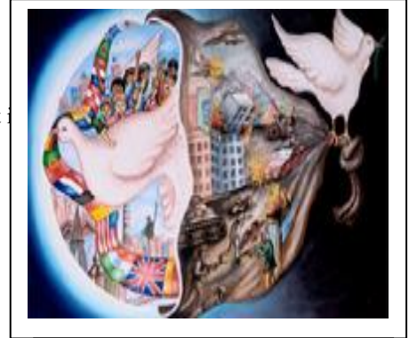
Theme: Vision of Peace

The Gold Level: Light Keeper Master Award will recognize districts that meet The requirements for the Harbor Light Master Award, and also exceed membership growth of two percent or more from July 1, 2010 through April 30, 2011.