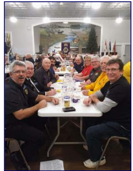
A visit to the Norwood Lions Club in November by the Cobourg and Peterborough Lions Clubs