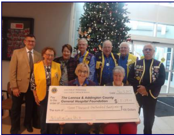
Cheque presentation ~ November 16th.

These two Lions Clubs together make a huge contribution to the health care community.