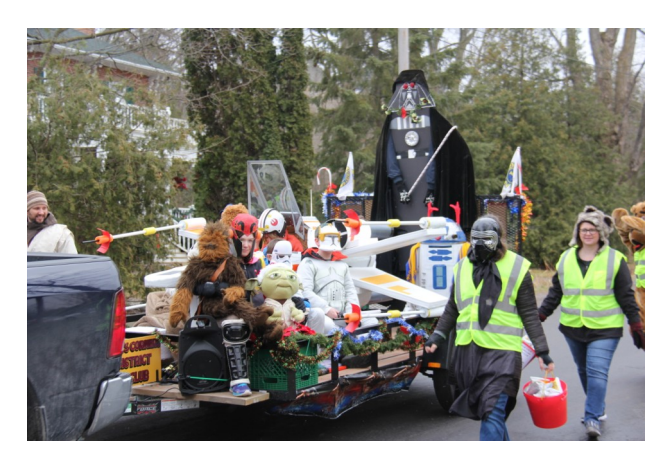
The Fowlers Corners Lions Club parade float