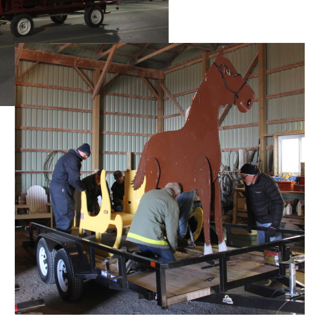
Our Santa Claus Parade float goes together—note the almost real horse