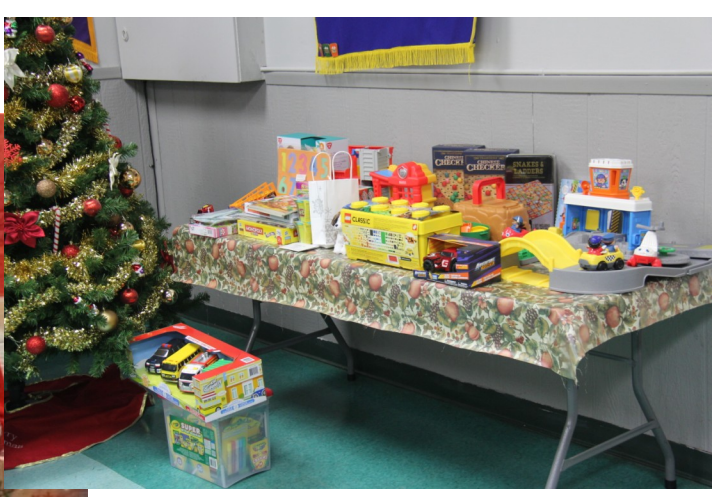
A good selection of toys for the Legion to distribute