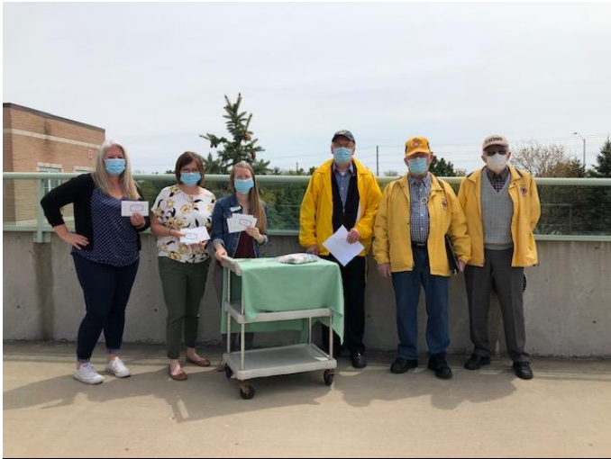
Amherstview Lions assisting their hospital.