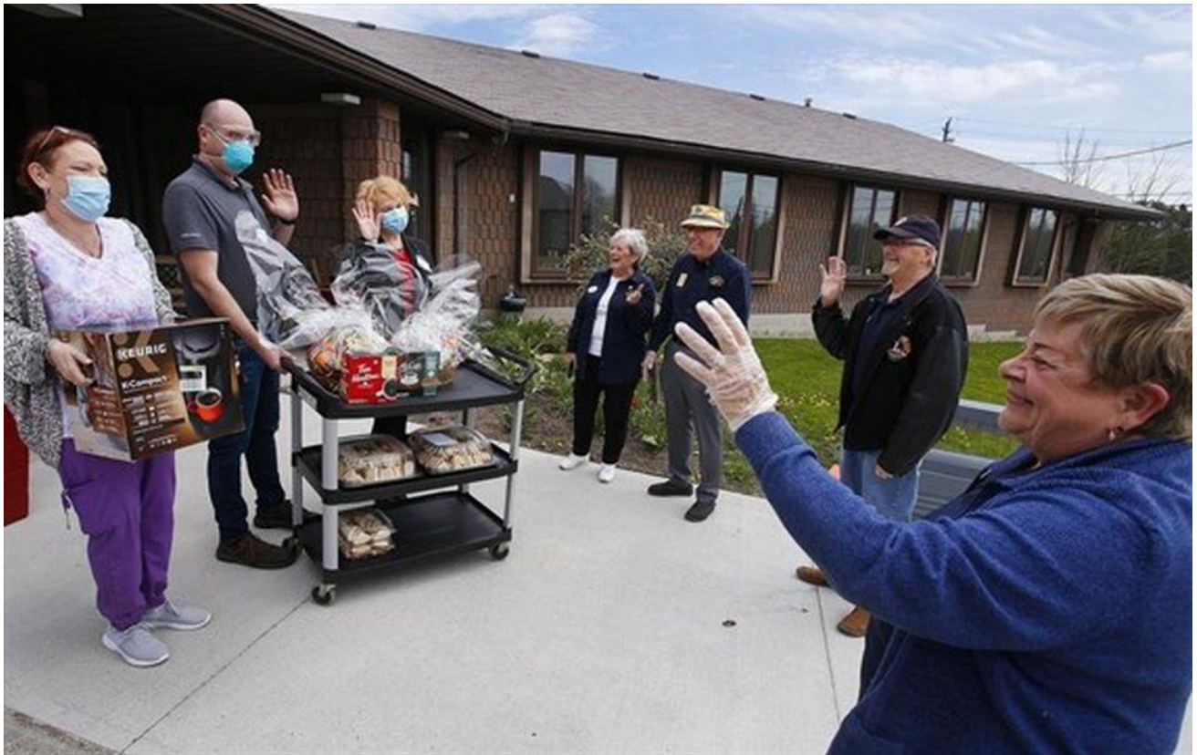
Chemung Lake District Lions supporting staff at the Riverview Manor Nursing Home, Peterborough