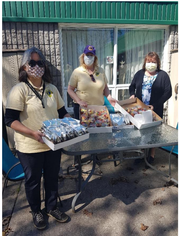
Cobourg Lakeshore Lions delivering treats to Front Line Workers in a neighbourhood Nursing Home.