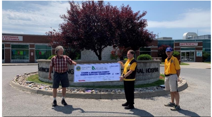
Odessa Lions assisting their hospital.