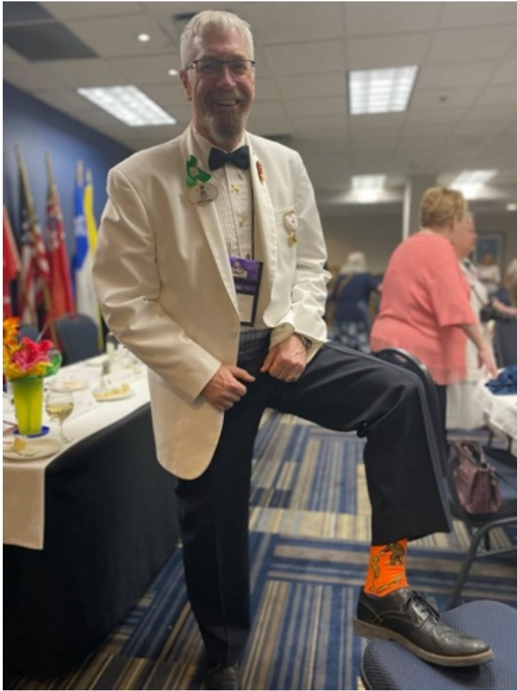
Crazy Sox at the A-4 Convention 2022