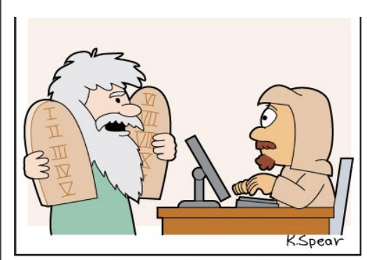
"I want you to scan these and put them in the next newsletter."