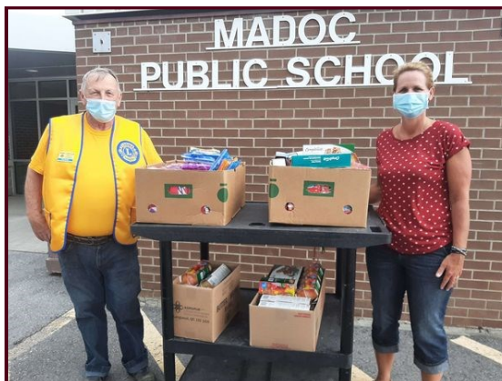
Madoc Lions Supporting Food Bin Program at Madoc Public School... Great job Lions!