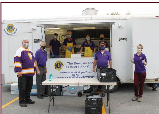
Sept 26th... Bewdley Lions serving up Fare Food from their chip truck.. Great teamwork Lions!