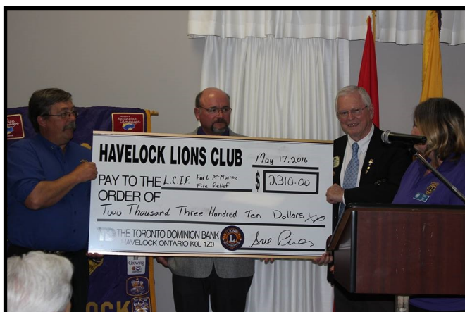
Havelock Lions Presentation of $2,310 to LCIF for Fort McMurray Fire Relief