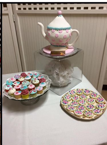
Cobourg Lions Cobourg Lions raised $1,225 At their Vintage Tea event in support of Northumberland's Biggest Coffee morning.