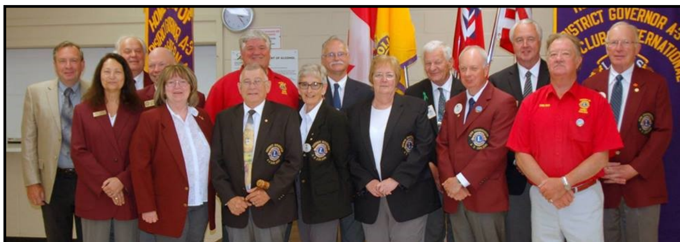
Cabinet Team—District A-3 for 2016-17