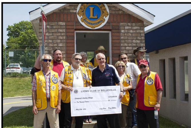
Belleville Lions Presented a $10,000 donation towards the Children's Safety Villages overall fundraising goal.