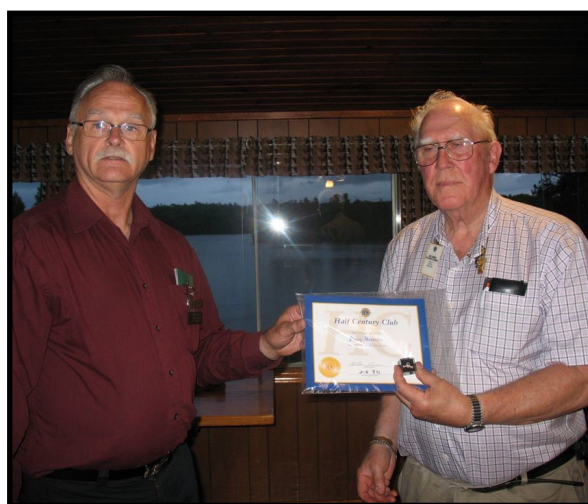
Sharbot Lake Lions