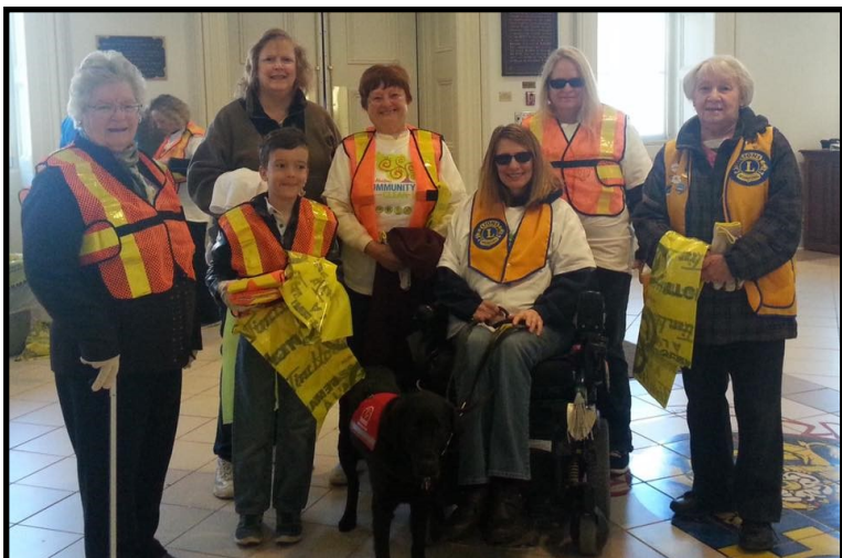
Cobourg Lakeshore Lions

Cobourg Lakeshore Lions along with Guide Dog Ryden, did their part cleaning public areas in the community.