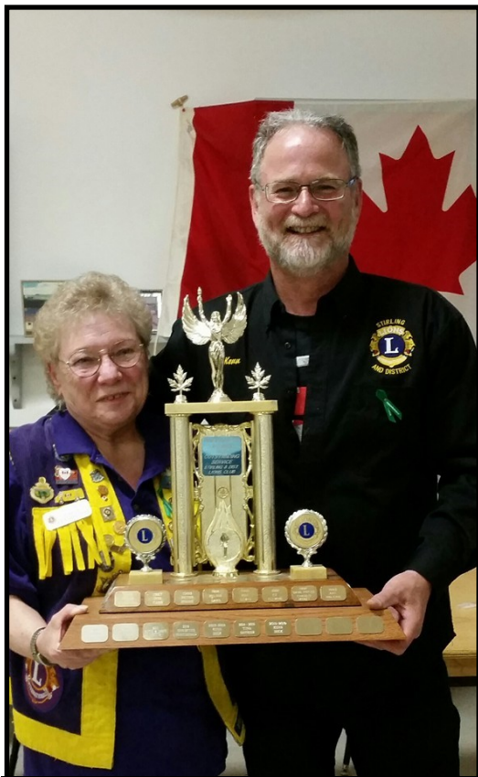
Stirling & District Lions