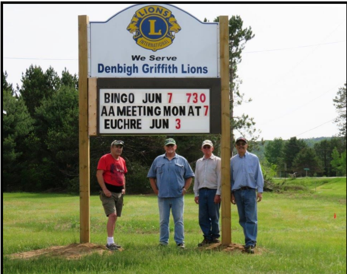
Denbigh-Griffith Lions Legacy project—new sign installation by Lions and volunteers.