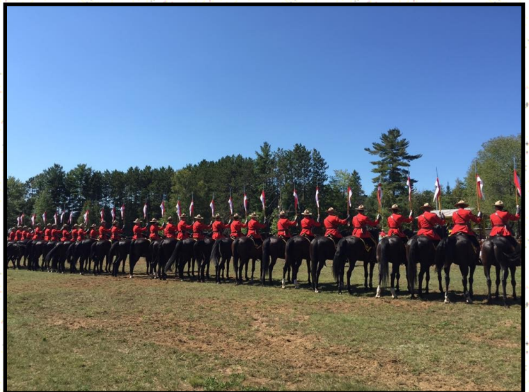
Apsley Lions —sponsored the RCMP Musical Ride on September 5th—an awesome show!