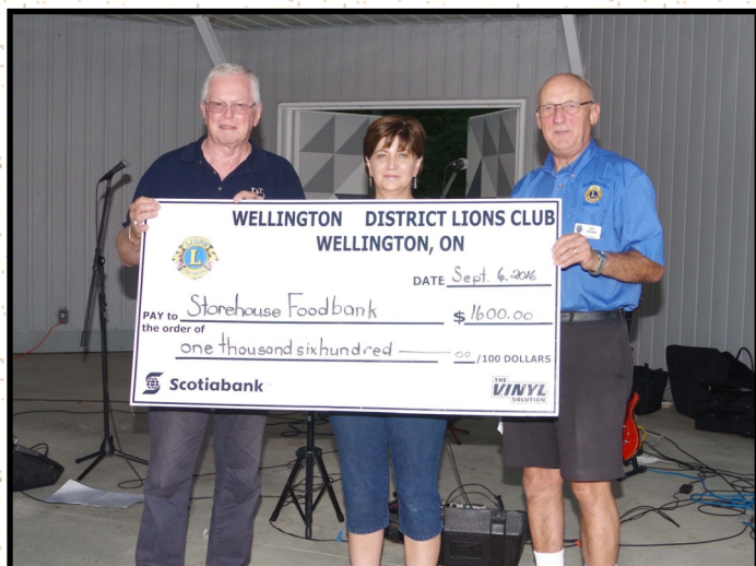
Left—The Wellington District Lions held Concerts in the Park weekly over the summer and donated $1,600 to the local food bank from donations received.