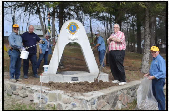
Bancroft Lions - Spring Cleaning: Members of the Bancroft Lions club at their annual clean-up of the Lions arch, located at the entrance to the town visitors' centre.