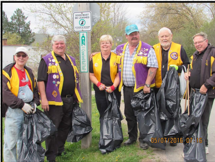
East Peterborough Lions —pathway cleanup on their Day of Service.