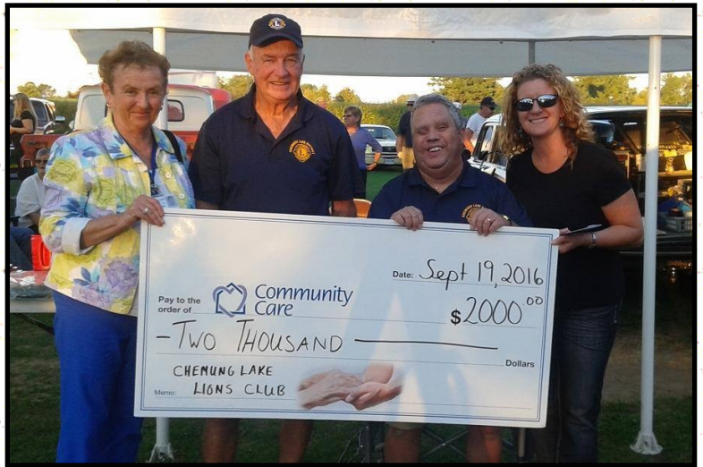
Chemung Lake Lions —donated $2,000 to Community Care.