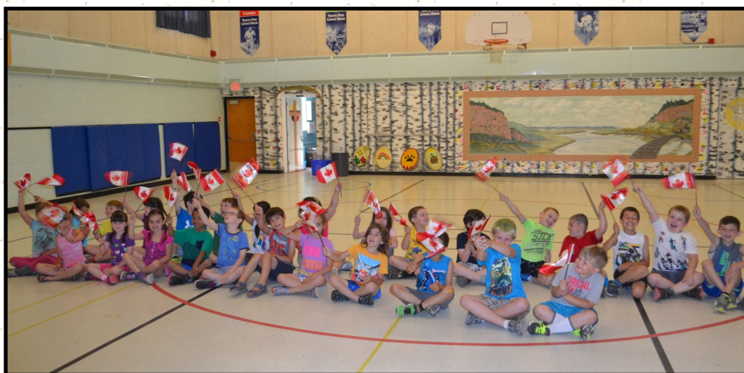
Bancroft Lions —Students at Our Lady of Mercy Catholic School in Bancroft wave their Canadian flags, presented to them just before Canada Day by the Bancroft Lions Club as part of Lions Project