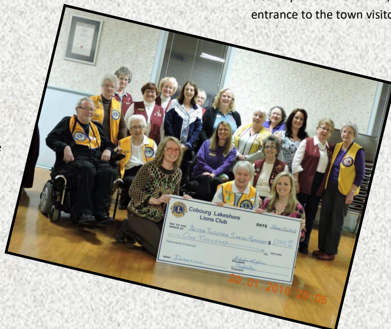
Cobourg Lakeshore Lions —donate $1,000 for Syrian refugees.