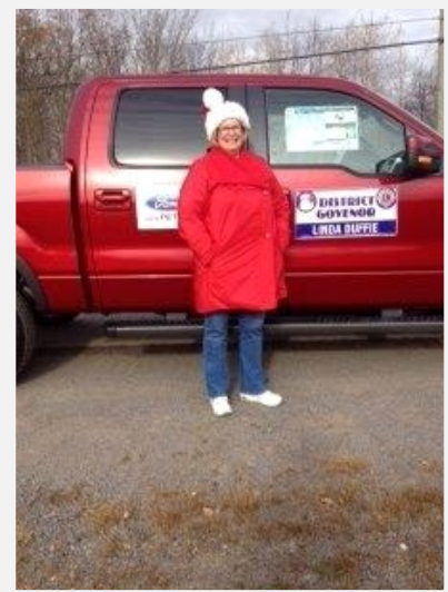
A Fun Day with the Amherstview Lions at their Santa Claus Parade Saturday, November 1st