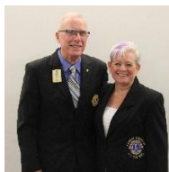
DISTRICT GOVERNOR SUSAN TAYLOR