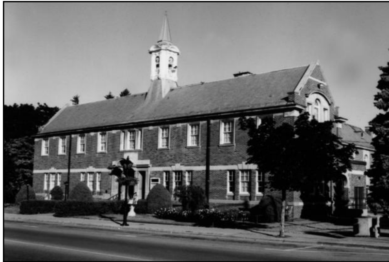
Newcastle Community Hall