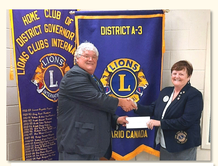
$10,000 Donation to Lions Foundation of Canada Difference Campaign by District A3 Lions

East Peterborough Lions Club ~ Host Club