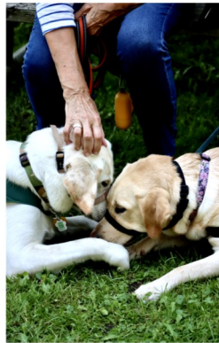
captured some very special moments with puppies in training!