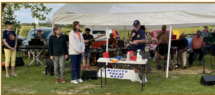
Pictured: Cruise Night presentations.

At their Monday Cruise Nights in August, the Lions collected hundreds of pounds of non-perishable food, along with monetary donations from car owners and guests. Further, the Lions were happy and pleased when the Misfits Vocal Band generously donated back their entire service fee ($500.00) to the food bank. Overall, this food drive turned into a great success that will be a wonderful help to many families in need.