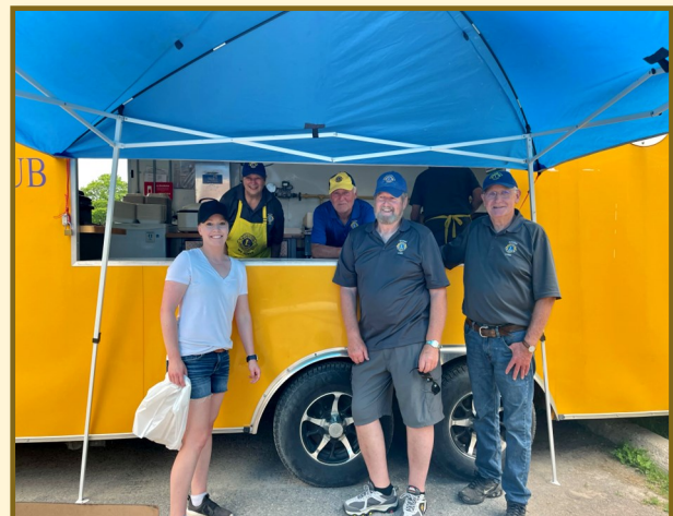
Photo: Keene Lions working at the Chicken Fry Fundraiser, Northshore School

Over the last 6 months, the Keene Lions Club has been working with the parents of students at Northshore School to raise funds to replace their playground equipment. The Lions have held a euchre tournament, a toll road and a chicken fry to support the group. So far, almost $7,000 has been donated to the cause.