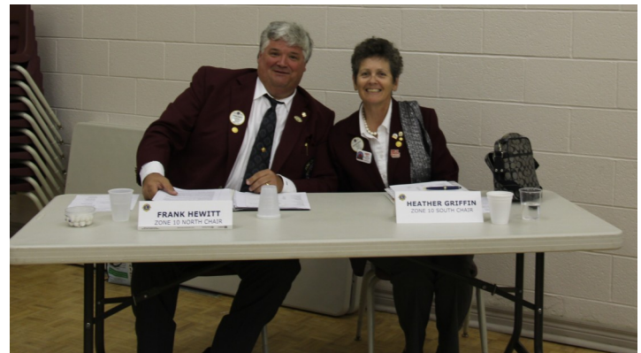
A happy pair of Cabinet members

Obviously an intense discussion going on