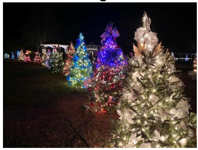
Jefferson Lions Club would like to thank the MANY folks who made our annual Enchanted Forest possible!! Not only does the Enchanted Forest add a magical and beautiful touch to our community during the Christmas season, but it also helps to fund scholarships for area youth.