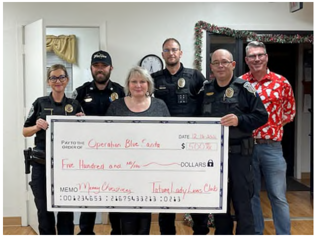
Tatum Ladies Lions Club presented a check to Operation Blue Santa