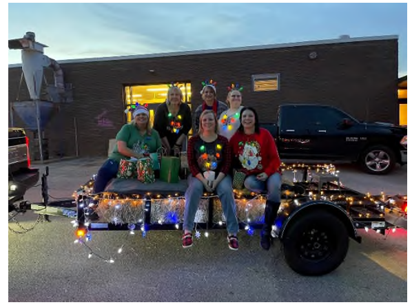
Tatum Ladies Lions in the Christmas parade