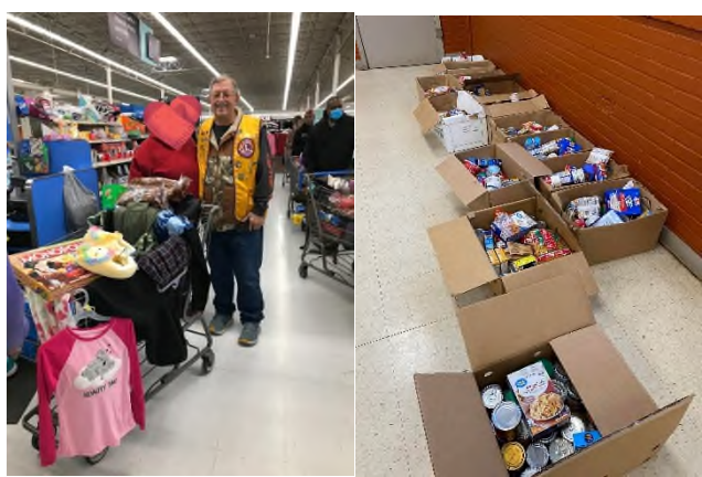
During the last month the Judson Club has completed twenty-three projects, counting donations. Totaled 722 volunteer hours, served several thousand people. And made donations to local charities and groups totaling $18,900.