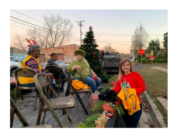
The Marion County Chamber of Commerce Christmas Parade and Lighting of the Christmas trees at the Enchanted Forest was AWESOME