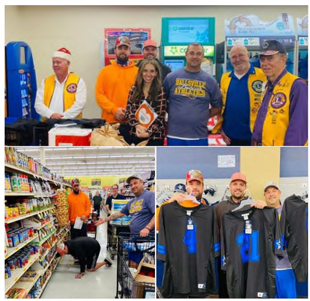
Longview Lions and Albertson's treated Mercy Manor and House of Disciples to a shopping spree.