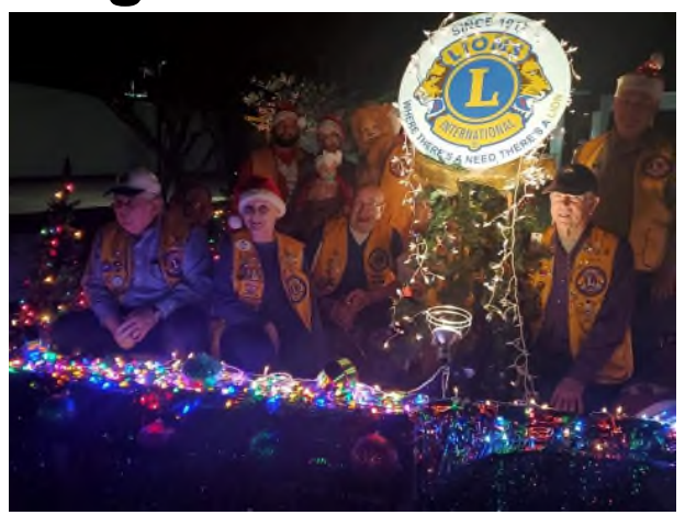
Longview Lions participated in the "Light Up Longview" Christmas parade. Yes, we roared!