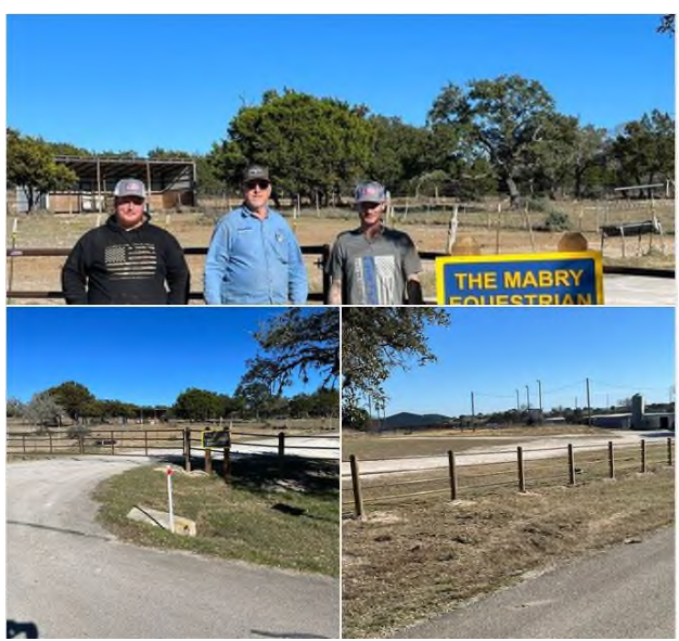
Texas Lions Camp got a new Priefert ponderosa fence compliments of Priefert and a couple of "east" boys that installed it.