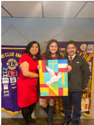
Mt Pleasant Lions 2021-22 Peace Poster winner