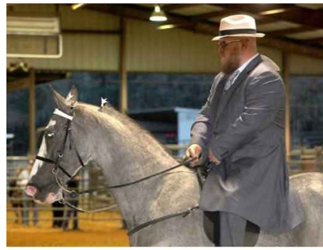
Horse lovers from across the country gathered at the Marshall City Arena for Marshall Lions Club 59th annual Charity Horse Show. The event is one of Marshall Lions Club's largest fundraising initiatives and assists in funding numerous annual programs in place within the organization.