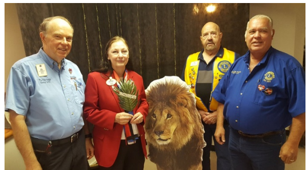
Longview Lions (two missed the hunt)