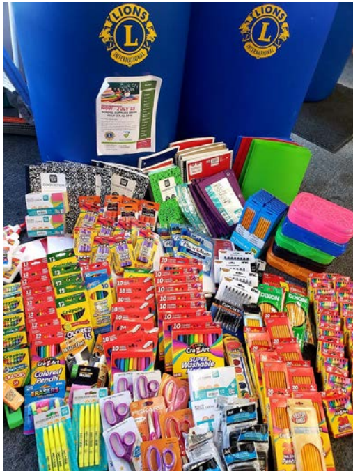
We may be small, but we CAN make a difference! Cooper Lions donated school supplies