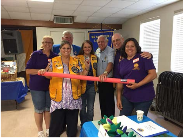
Italian Scavenger Hunt-Winning Team