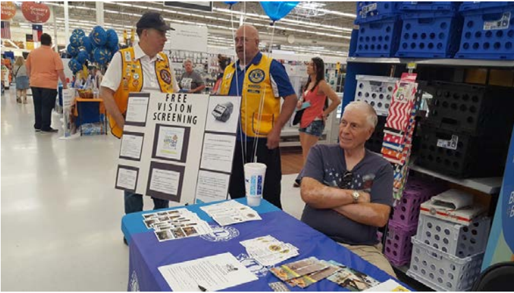
Longview Lions partnered with Walmart to do Vision & Diabetes Screenings on July 20, 2019 [64 people served]