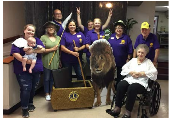
Judson Lions ready for the hunt...