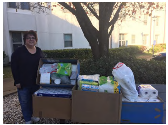
Spreading Christmas Joy and serving our Community. Dropped off boxes of paper goods to Eden Place.