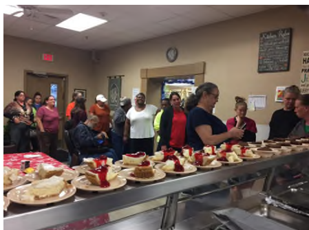
House of Hope -- Judson