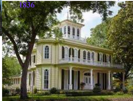
House of the Seasons, 1860