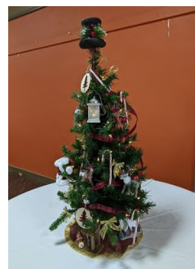
Henderson Lions participated in the Chamber of Commerce Christmas tree and wreath auction. This is the 6th year the Chamber has hosted the event.