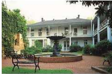
Excelsior House Hotel, 1850