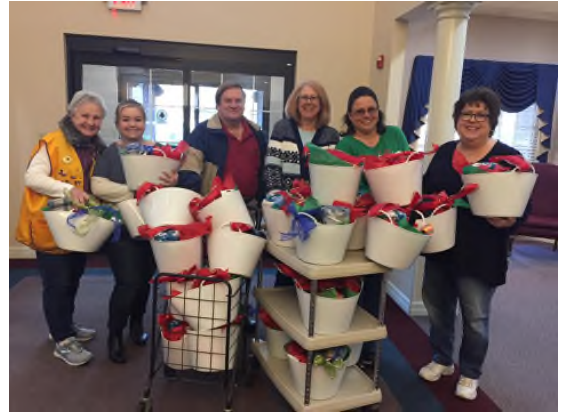
Judson Lions put together and donated 26 gift baskets to the memory care unit at Buckner.