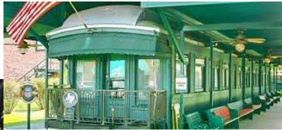
Jay Gould's Private Rail Car, 1836