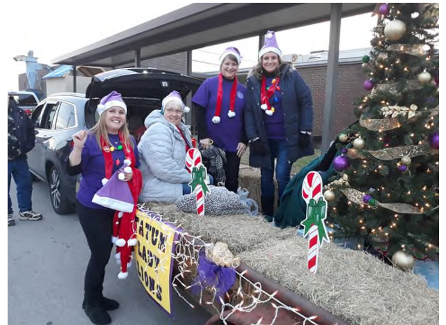
Tatum Lady Lions at the Christmas parade