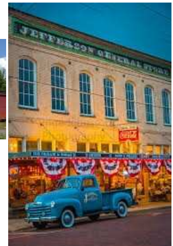
General Store with 5 cent coffee