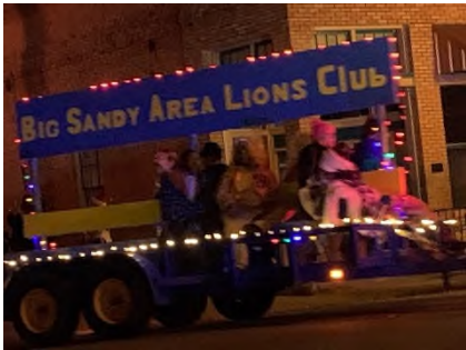
BSALC Lions participated in the Big Sandy Christmas Parade