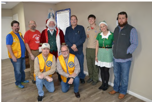
Ore City Lions did their annual Pancake Breakfast with Santa and his helpers