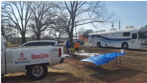
BSALC Lions also helped with Big Sandy Love Project's Supper with Santa free meal and fun activities, held a blood drive for Carter Blood Care and a Frito Pie fundraiser (above) for scholarships, bagged and donated 50 lbs of rice and 50 lbs of beans for the Big Sandy Agape House, donated canned foods to the Hawkins Helping Hand... Whew! OK, everyone, it's time to rest for a few days and then, we will begin 2020 with a bang. Happy New Year, Y'all!