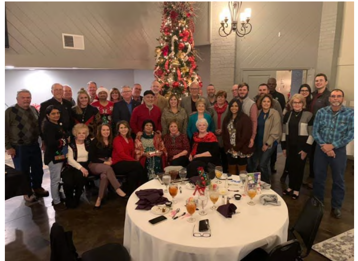
Mt. Pleasant Lions celebrate at their Christmas party.