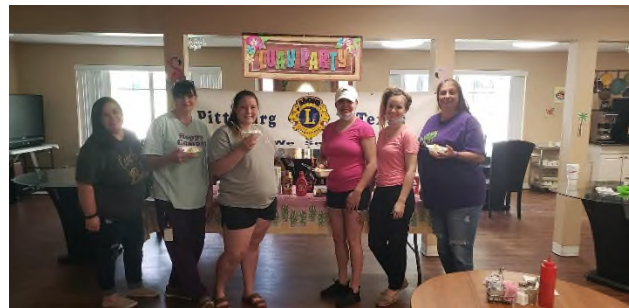
A few of the staff at Southern Wind Manor

Pittsburg Lions treated the staff and residents of Southern Wind Manor to a surprise ice cream sundae bar. It had been over 5 months since the residents at Southern Wind Manor had visitors or loved ones come spend time with them because the COVID quarantine they have been unable to have volunteers come in and do their nails, play games, put on programs or even eat lunch with them.