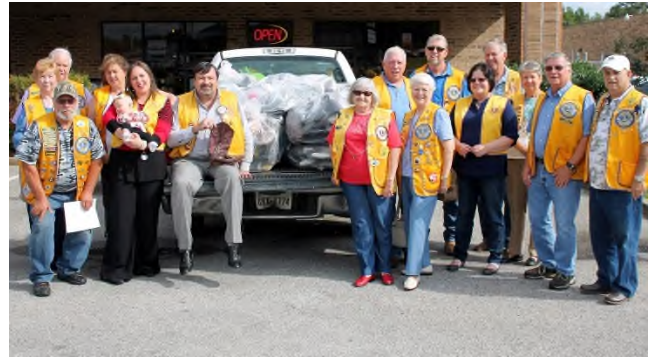
We are Moving. Tyler Lions Club will now meet at Traditions Restaurant located at 6205 S. Broadway in Tyler. Come have lunch with us on the first and third Tuesday of each month