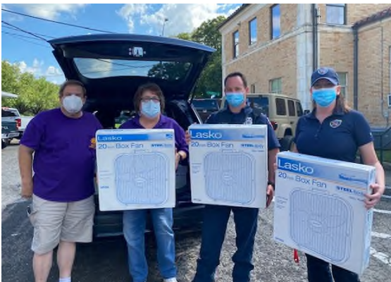
Judson Lions purchased fans from Home Depot in Longview and donated them to the Longview Fire Dept to give out to needy residents