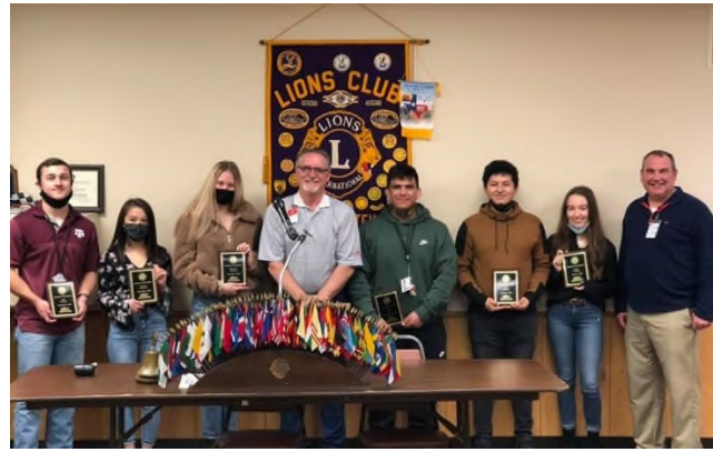
Kilgore Lions honor KHS Students of the Month for November, December, and January.