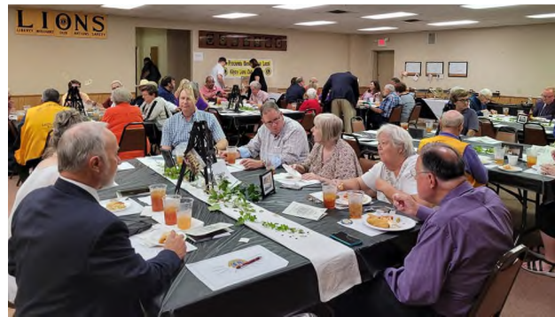
Great turnout for the Kilgore 90 th ...