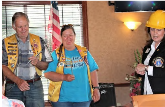
Everything looks like a nail?