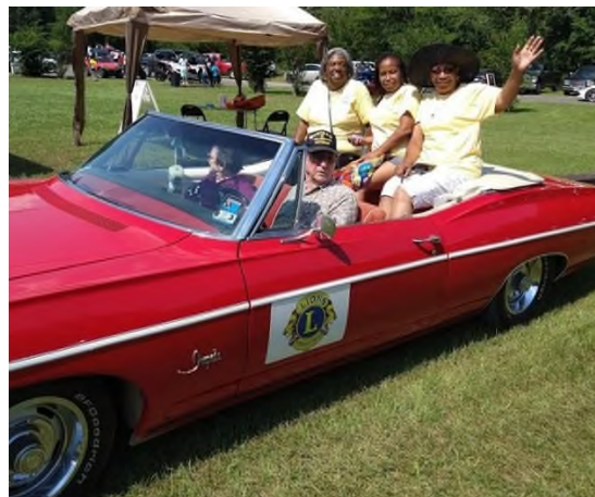
A better photo