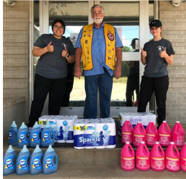
Henderson Lions Club donated bleach, Dawn soap and paper towels for the animal Center.