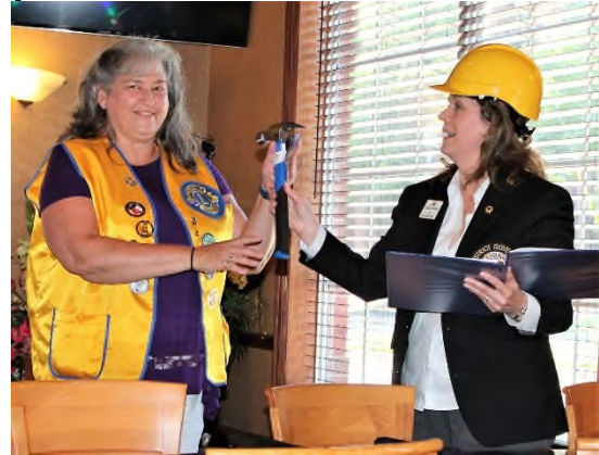
When you have a hammer...