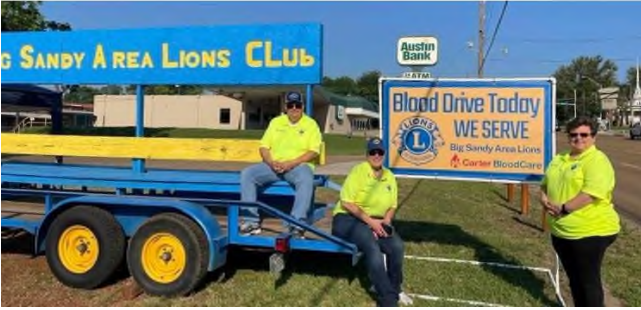
Blood Drive June 2021