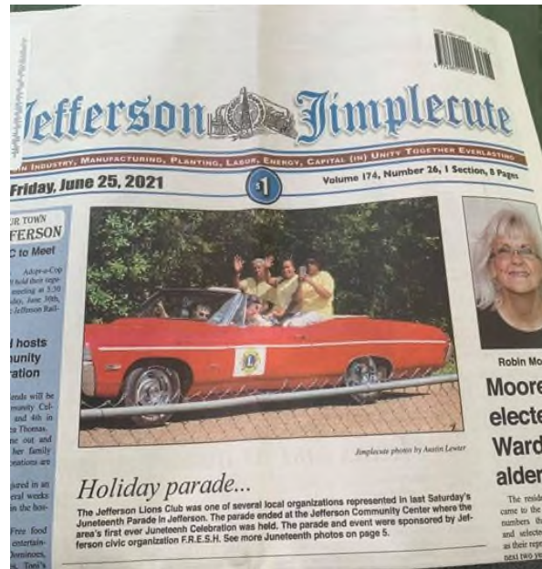
Jefferson Lions rode in the community’s Juneteenth parade, had a Lions booth, and contributed to the BBQ. Front Page (above fold) PR. Way to go, Jefferson Lions