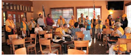
Tyler Lions Officers Installation for 2021-22