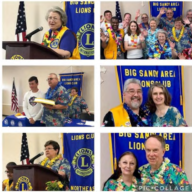
Installation Banquet 2021 Collage *****