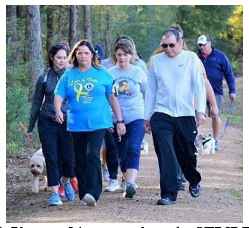
Mt Pleasant Lions conducted a STRIDES walk for Diabetes Awareness.