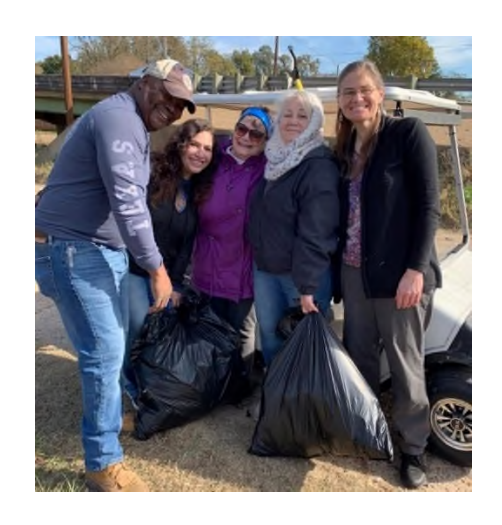
Jefferson Lions' monthly community service project was picking up trash

International: lionsclubs.org Lions Camp: lionscamp.com