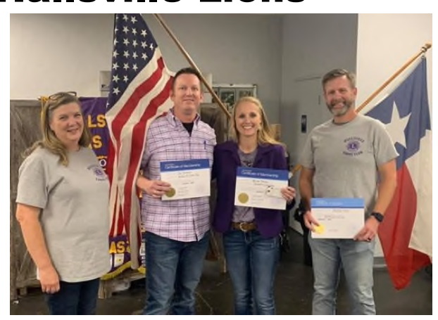
Hallsville inducted their newest Lions