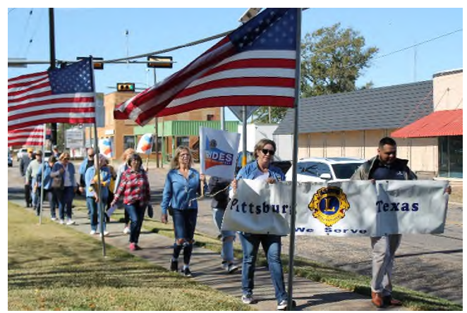
Pittsburg Lions conducted a STRIDES walk for Diabetes Awareness.