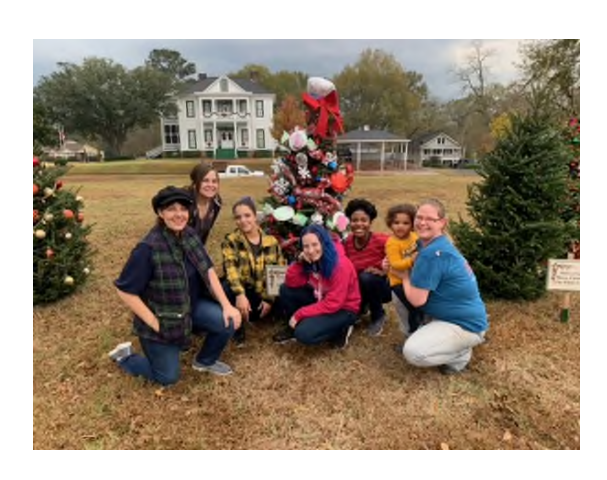
Jefferson Lions decorating trees in the Enchanted Forest

[Note: Jefferson Lions were also there for the event]