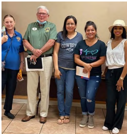
Gregg County Latinos