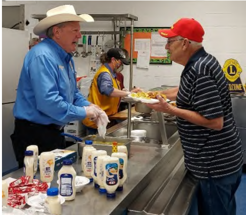
Serving at Yantis-Lake Fork Club