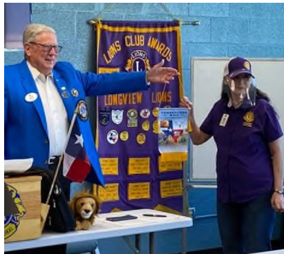
Longview Lions Club Visit

Governor Chet’s goal was to visit every club in the district, in person, despite the pandemic