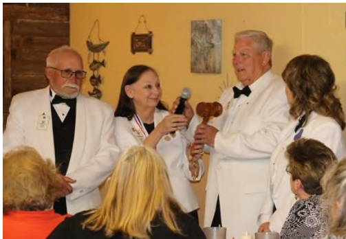
Passing of the Gavel

Rules: Open to ALL Lions of District 2-X2 New Lions must be reported in Lions International Membership site by midnight on May 31st for the month on May 2021. Drawing and winners announced on Saturday, June 5th. Checks will be handed out at the Officers Training Class on Saturday, June 12th in Mt. Pleasant. Unclaimed checks will be mailed.