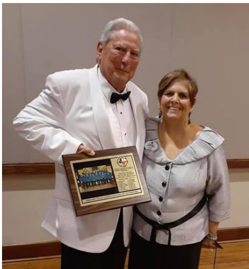
MD-2 Council 2020-2021 Plaque

Contest: • Sponsor 1-2 new Lions—name will go into drawing for $50 • Sponsor 3 or more new Lions—name will go into drawing for $100 • Sponsor the most new Lions in the month of May receive $150 (in case of a tie a drawing will be held) • Club sponsoring the most new Lions will receive $250 plus will receive the Membership Traveling Trophy and bragging rights for a year!